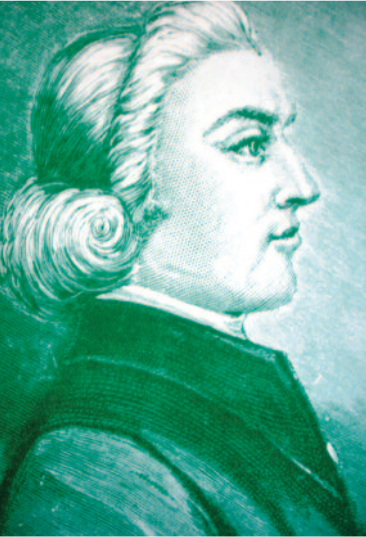
Above, top: Llangasty church, bottom: Howell Harris. Right: Llangors Lake, Welsh Crannog.

After lunch return to Talgarth stopping off in Trefeca to visit the museum at Coleg Trefeca, the home of Howell Harris, the leader of the Welsh Methodist revival in the early 18th Century. Bring the afternoon to a close with a visit to the Church of St Gwendoline in Talgarth. This historic Church dates back in places to the thirteenth century and is famous as the Church where Howell Harris was converted and eventually buried – If you are lucky you might hear the bell practice – as the six bells are capable of up to 38 peels.